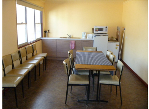
Bundaleer Cottage Kitchenette

Bed and bath linen, tea towels and basic kitchen equipment is provided.