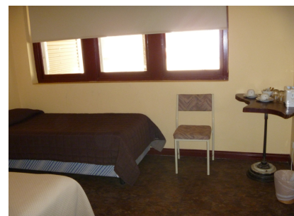
Bundaleer Cottage Room 7 & 8 – Bedroom & Bathroom