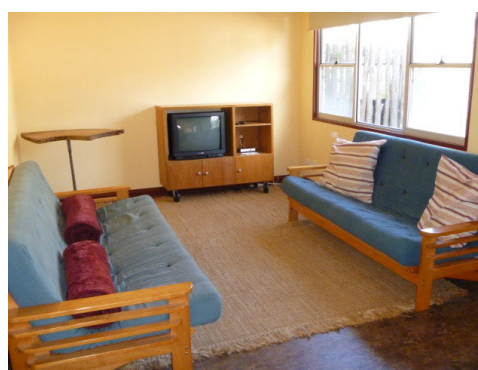
Bundaleer Cottage Lounge