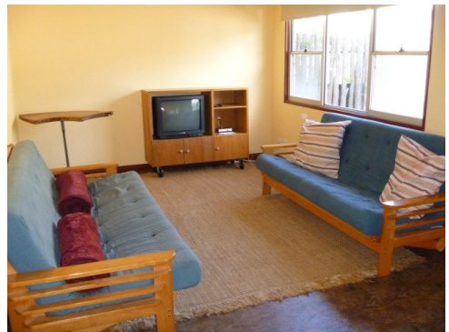
Bundaleer Cottage Lounge