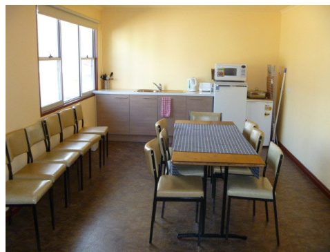
Bundaleer Cottage Kitchenette

Bed and bath linen, tea towels and basic kitchen equipment is provided.