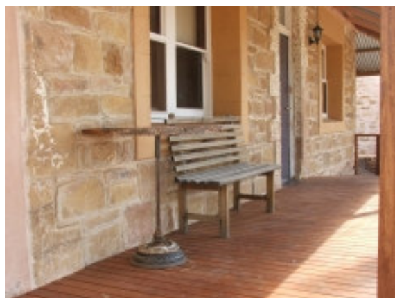
Bundaleer Cottage Veranda

$500 per night based on 8 beds (One queen and one single per room), extra bed/linen $20 per person per night. Two night minimum applies. Three night minimum applies on long weekends. Continental breakfast for children can be included for extra $4 per child